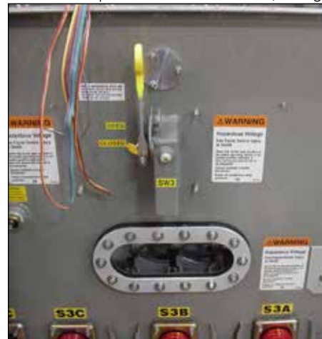
Figure 8. VFI transformer with visible break.

With a fire point of 360 °C, Envirotemp™ FR3™ fluid is FM Approved® and Underwriters Laboratories (UL®) Classified "Less-Flammable" per NEC® Article 450-23, fitting the definition of a Listed