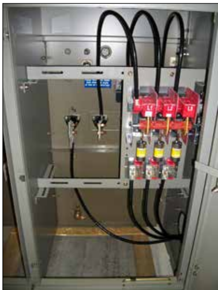
Figure 9. Modular transformer.

An MTU utilizes existing utility infrastructure, therefore eliminating the need to engineer and construct a dedicated communication network.