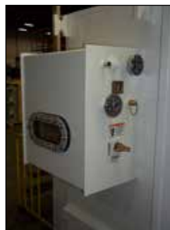
Figure 7. External visible break with gauges.