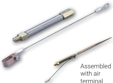
Assembled with air terminal

Spring point adaptors are designed to provide a flexible attachment point for air terminals. The adaptors can be used on points from 10" to 24" in length.