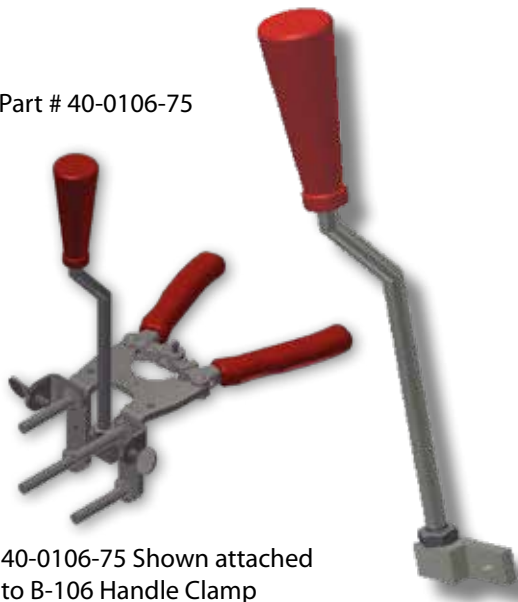
40-0106-75 Shown attached to B-106 Handle Clamp