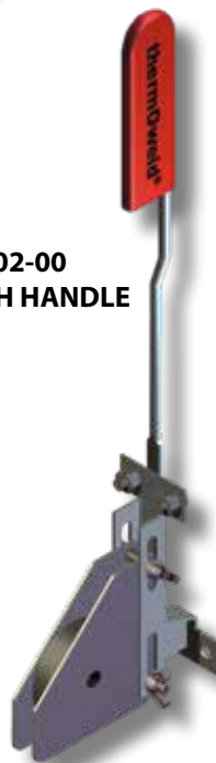
Part # 40-7202-00 SHOWN WITH HANDLE

The PK-3 integral magnetic clamp is adaptable to all thermOweld® price key 3 molds. A strong, 48 lb. magnet holds the mold in place and prevents leakage. Works on both cast iron and steel and can be used to weld to both pipe as well as flat surfaces. Designed for remote welding, using our thermOweld® EZ Lite Remote® ignition system. See page 232 for more information.