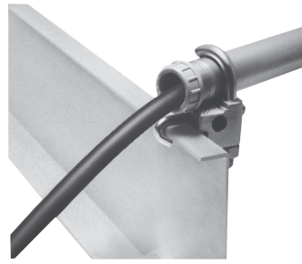
LCC (for use with outside rail tray)